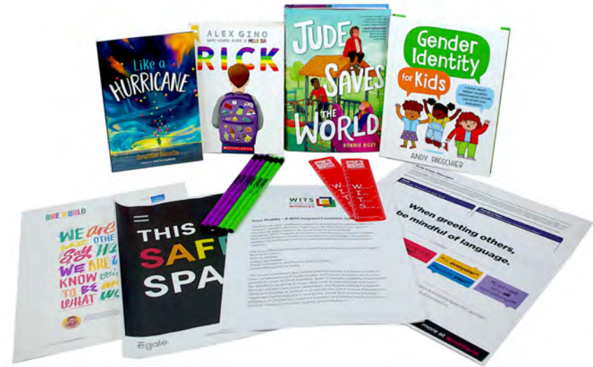
Contents of the Focus Module on Sexual Orientation / Gender Identity for ages 8-12. All nine Focus Modules were introduced in 2024 and represent our first steps towards inclusion-focused education.

The WITS Foundation advances several United Nations Sustainable Development Goals through its education-based programs for children and youth. Our work promotes Good Health and Wellbeing (SDG 3) by supporting mental health, resilience, and positive peer relationships. We contribute to Quality Education (SDG 4) by equipping schools with evidence-informed tools that foster safe, inclusive learning environments. By addressing bullying, discrimination, and exclusion, our programs support Gender Equality (SDG 5) and advance Reduced Inequalities (SDG 10), empowering young people to build more just, respectful, and inclusive communities.