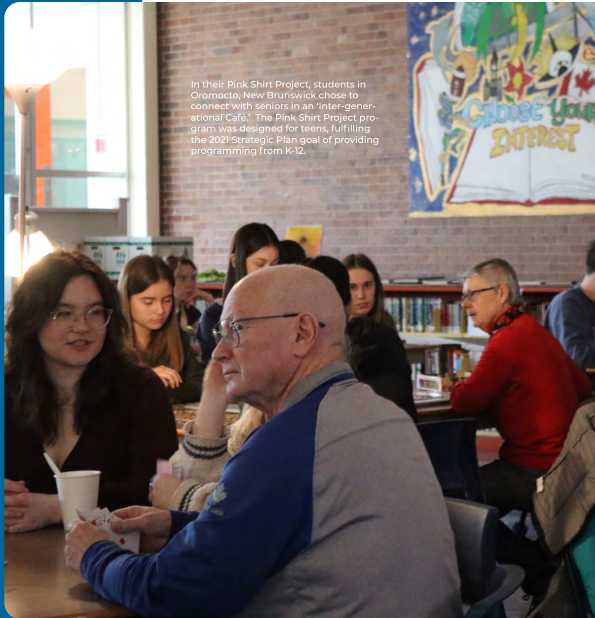
In their Pink Shirt Project, students in Oromocto, New Brunswick chose to connect with seniors in an 'Inter-generational Café.' The Pink Shirt Project program was designed for teens, fulfilling the 2021 Strategic Plan goal of providing programming from K-12.

In next steps, Foundation management is developing action plans to accomplish the strategic priorities.