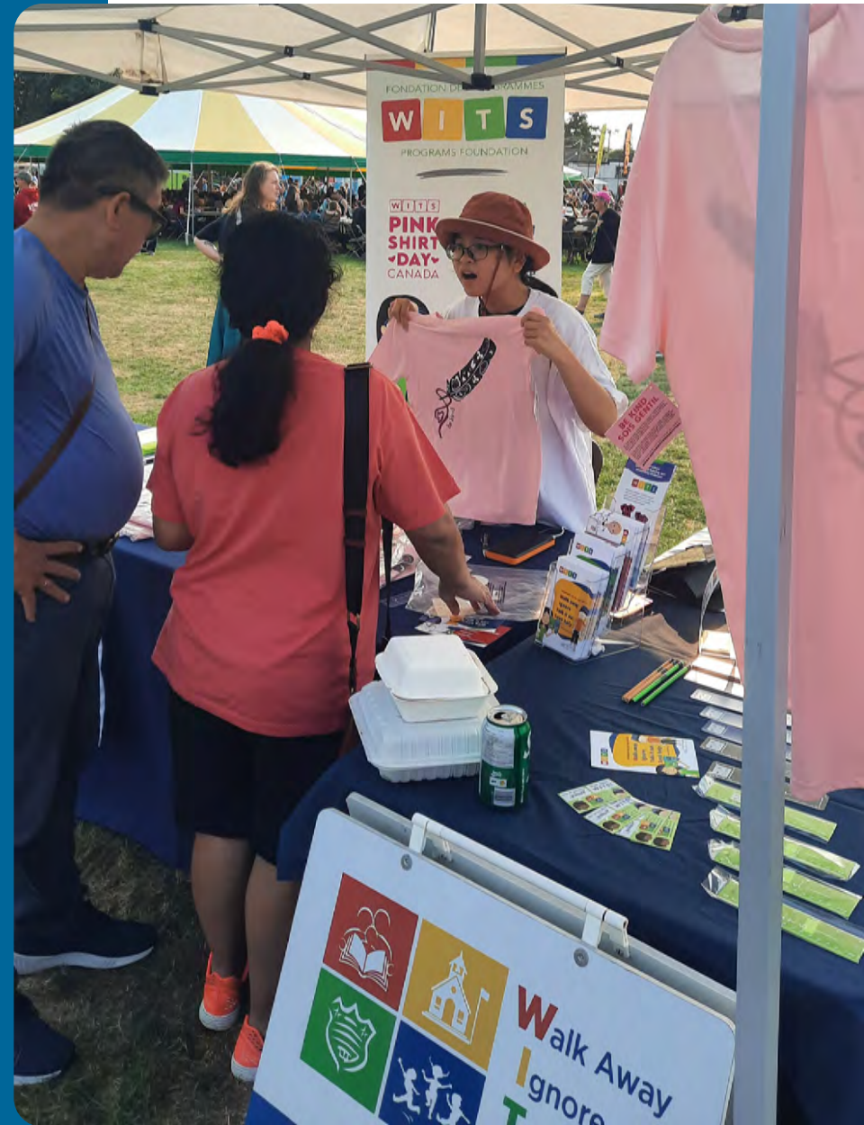
A volunteer promotes WITS and Pink Shirt Day at RibFest in Esquimalt, British Columbia. The Indigenous youth-designed shirts symbolize the recently expanded partnership between Naut'sa mawt Tribal Council and WITS Foundation.