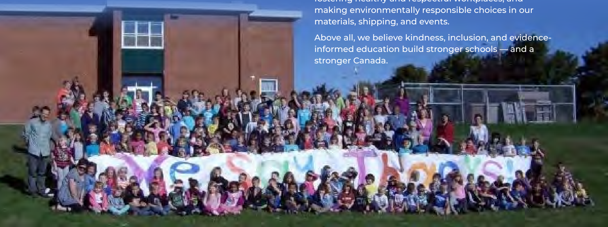
A big thank you to WITS from Glooscap Elementary School in Canning, Nova Scotia. WITS maintains a positive, robust presence across Canada.

Above all, we believe kindness, inclusion, and evidence-informed education build stronger schools — and a stronger Canada.