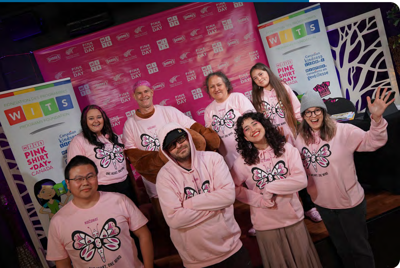
In-person guests and crew in studio for the Pink Shirt Day Live show in 2025.